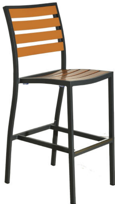
Antracite / Teak 517B-PW-TA