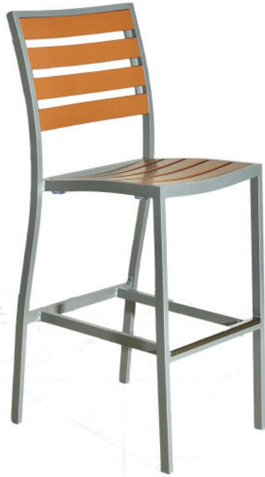
Silver / Teak 517B-PW-TS