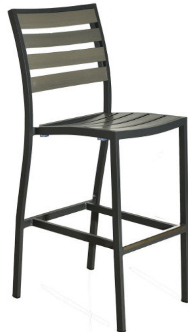
Antracite / Grey 517B-PW-GA