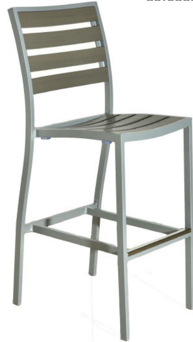
Silver / Grey 517B-PW-GS