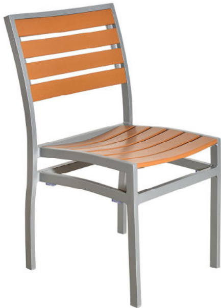
Silver / Teak 516S-PW-TS