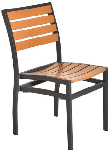
Antracite / Teak 516S-PW-TA