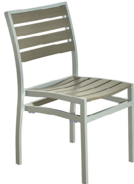
Silver / Grey 516S-PW-GS