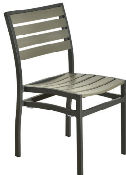
Antracite / Grey 516S-PW-GA