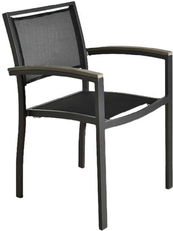
Antracite / Batyline 516A-BT-GA