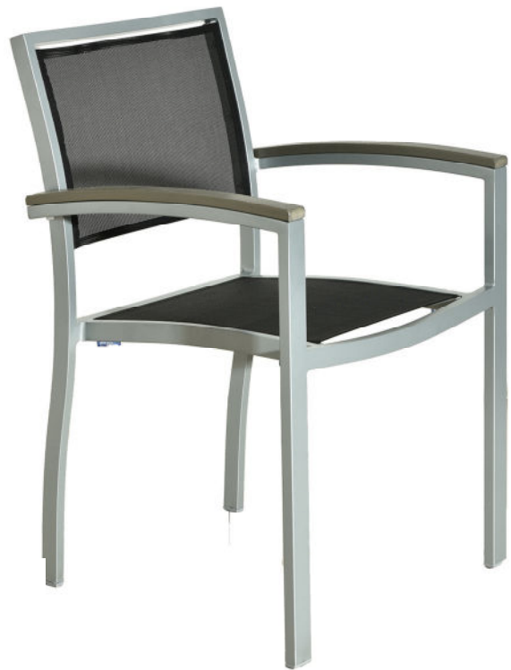
Silver / Batyline 516A-BT-GS